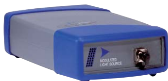
ONA610LS Light Source Options

Customers can specify a wide variety of light sources depending on their requirements for dynamic range and wavelength coverage (as shown in Fig 1). A single light source is suitable for any combination of chromatic dispersion, PMD or spectral attenuation measurements. Many customers choose to maximise efficiency by operating the ONA600 series mainframe and modules at a central hub in combination with two or more light sources at remote locations.