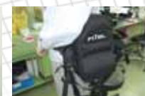
④ Working Belt as Shoulder Pack