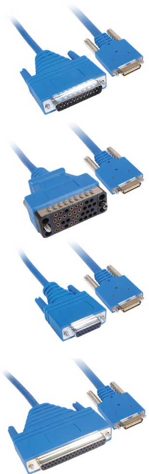
Smart Cisco Data Cables